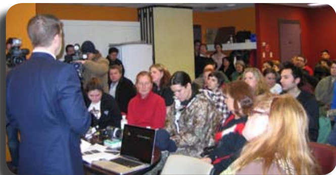
Public Forum on Policing, Winnipeg, Manitoba, Jan. 14/09