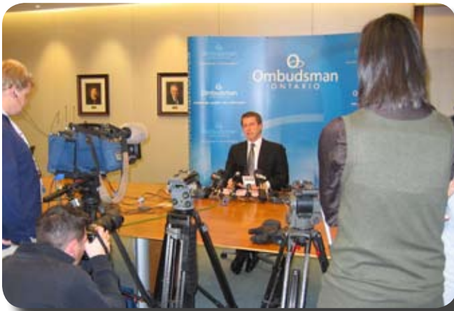
Press Conference, Ontario Ombudsman Office, Feb. 5/09

amount originally reported by the OLG, which also identified six types of “potentially fraudulent” behaviours among its ticket retailers.